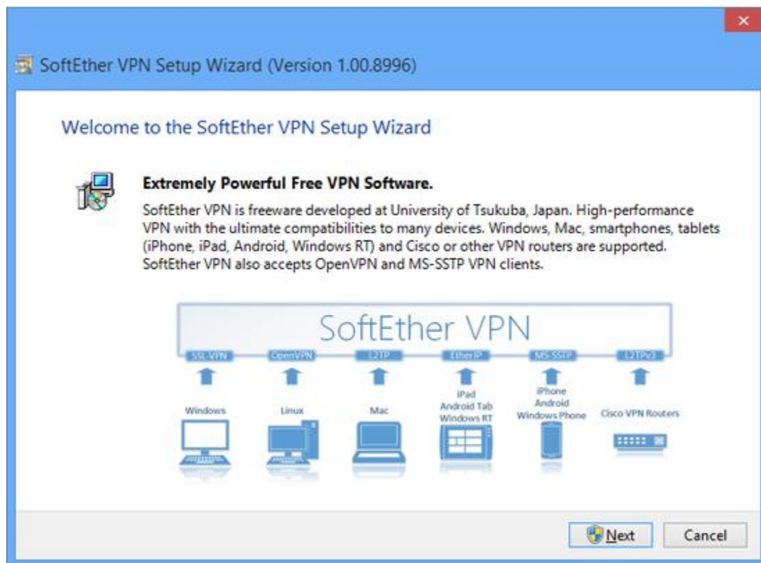
VPN Client Installer

Start the installer by double-clicking the VPN client installer file. Using the installation wizard, you can select the name of the installation directory. (By default, the program is installed to Program Files\SoftEther VPN client on the system drive.) The VPN Server process writes large log files to the installation directory, so we recommend selecting an area on the hard drive that has a large amount of disk space and is quickly accessible. If you have changed the installation directory please input the installation directory in the Directory box.